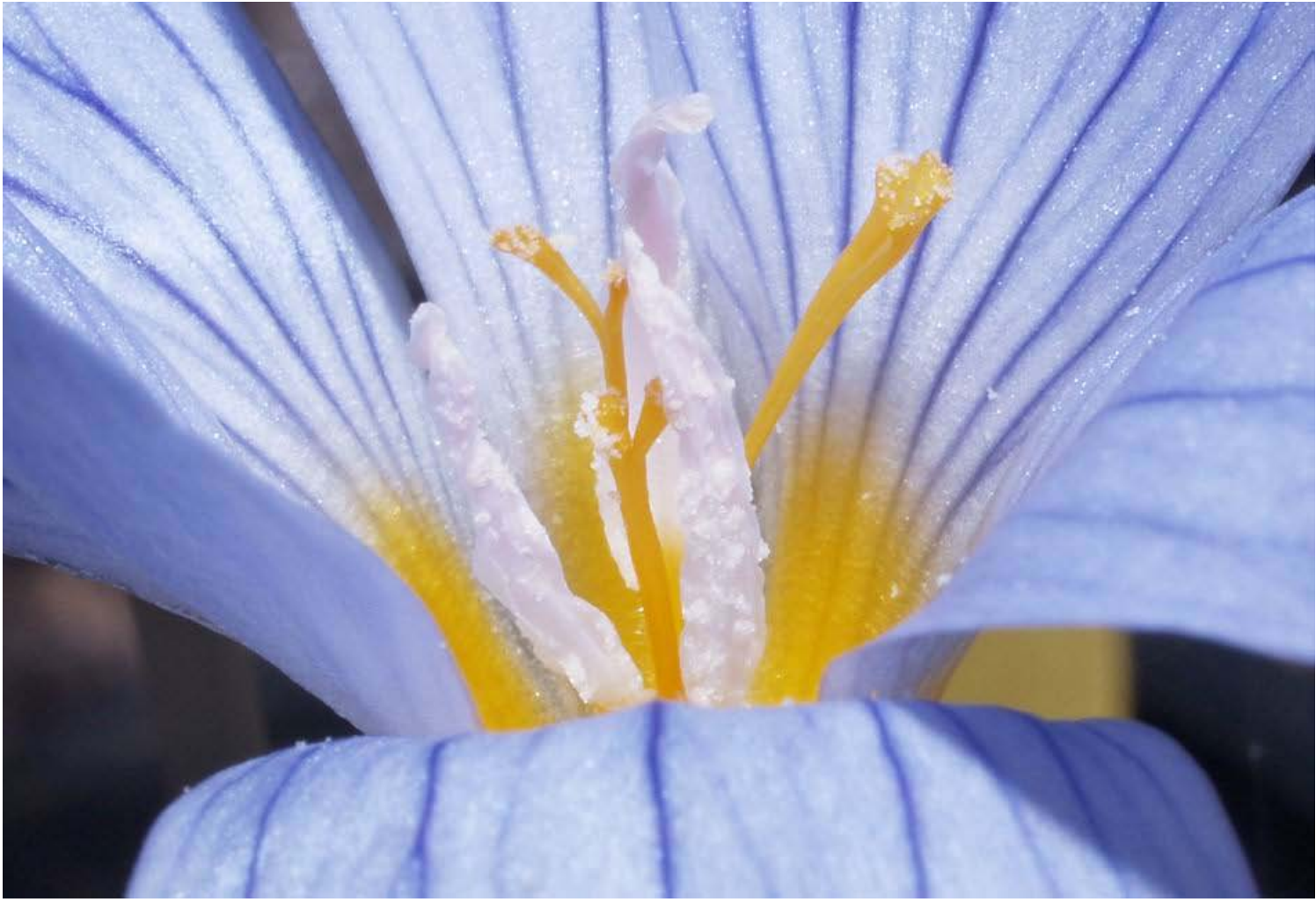
I find most Crocus irresistible with both the structure and colour combinations adding to their beauty. Pure white pollen, golden yellow style branches and gorgeous blue floral segments - what a combination.