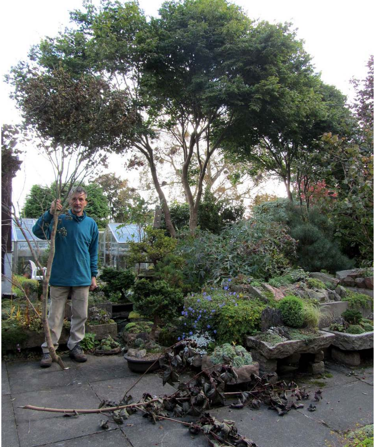
Last week as I wrote the bulb log I mentioned that we were being battered by the most terrible storm. I sat and watched our trees and shrubs, still heavy with leaves, getting bent nearly horizontal in the 75 to 80 miles per hour wind and was relieved that only a few branches were ripped off of the Acer you see behind me and some others.

BULB LOG 40...... 3<sup>rd</sup> October 2012