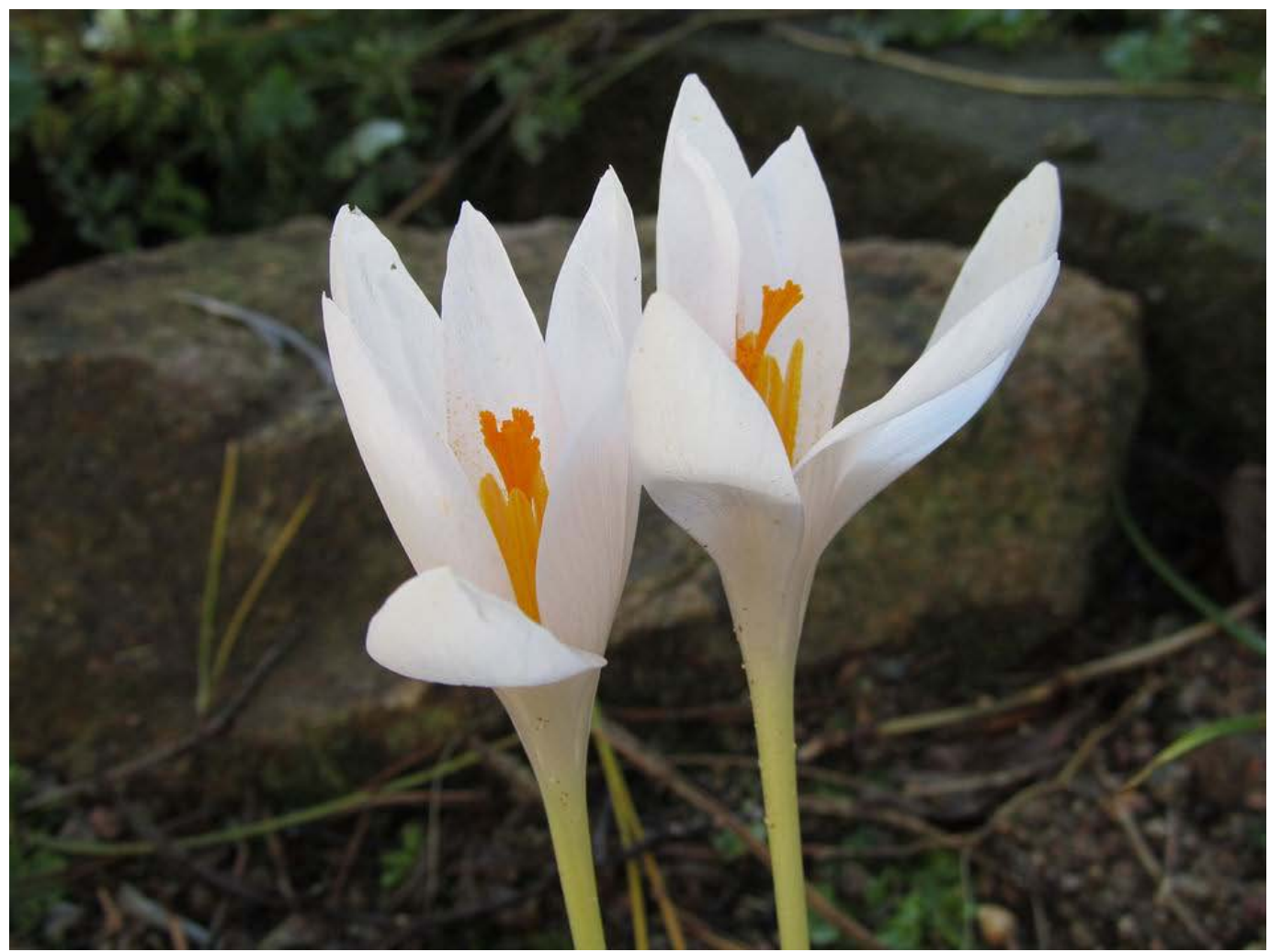
No garden should be without some of these easily grown autumn flowering bulbs.