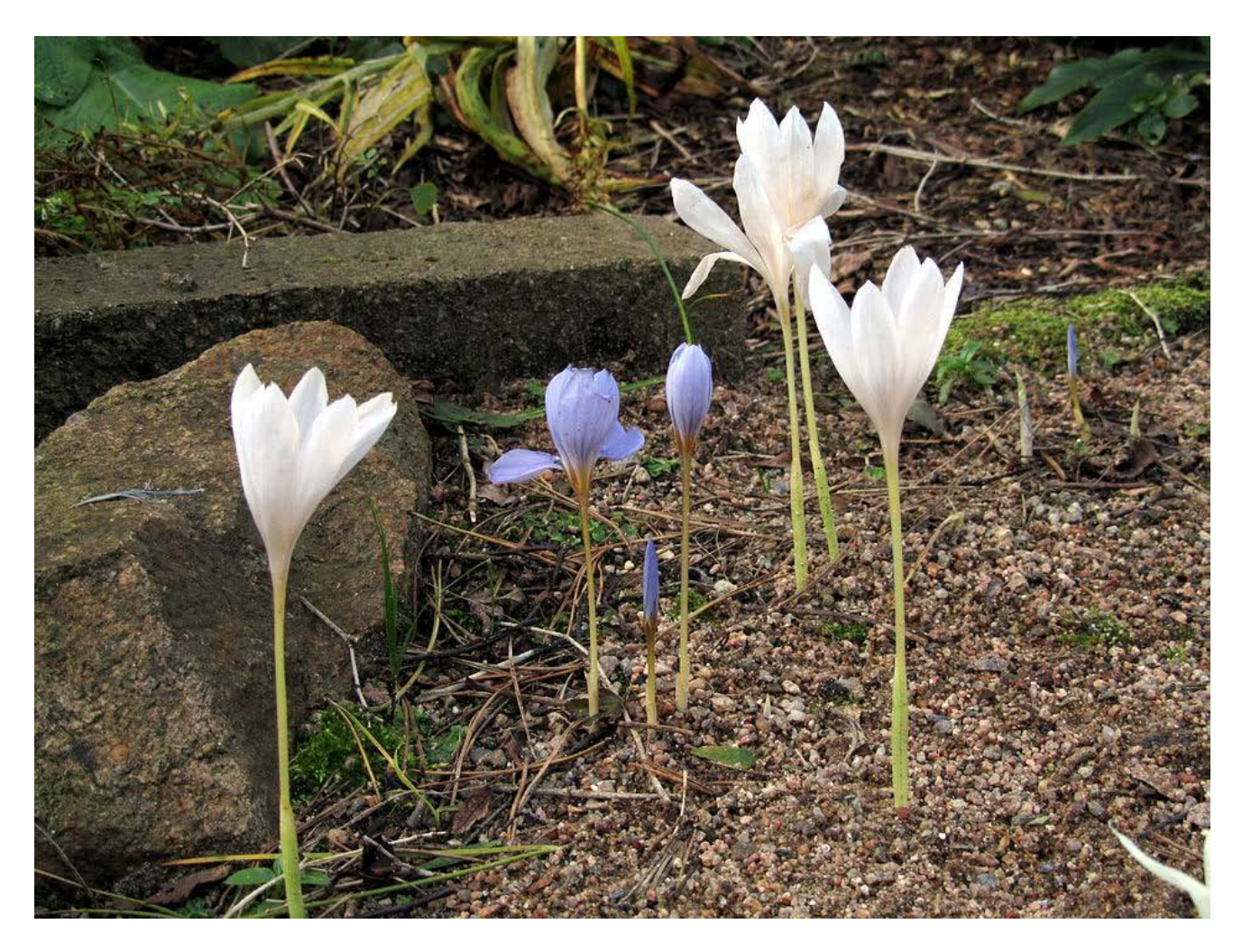
Crocus in the sand beds include C. nudiflorus albus and C. speciosus.