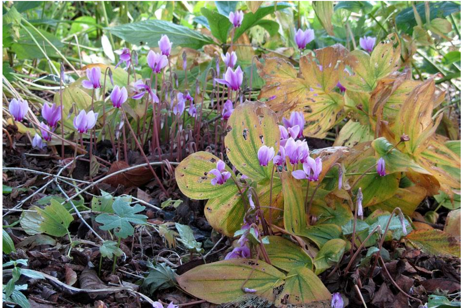
Above - yellowing Uvularia leaves contrast nicely with the emerging Cyclamen hederifolium flowers while below you can see the large red fruits of Podophyllum add a stunning effect along with some Arisaema berries.