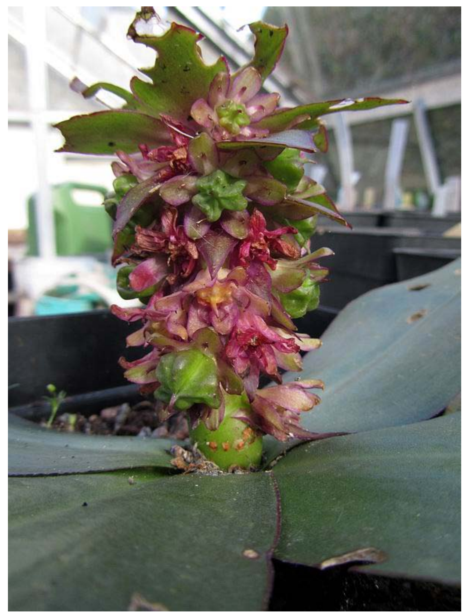
Another wonderful colour combination and structure is seen in this detail of Eucomis schijffii . I am hopeful that the few swollen seed pods indicate that I have at least some seed to look forward to.