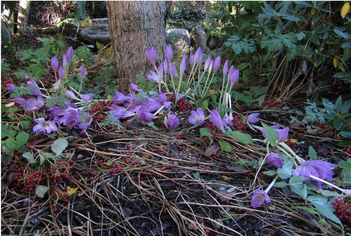
The Colchicum I pictured last week also got flattened but the flowers do not give up and continue to open and close as they react to the sun and any warmth and a steady supply of new blooms emerge daily.